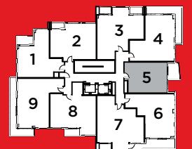
FLOOR 11 PENTHOUSE