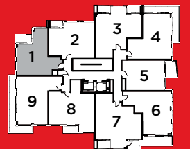
FLOOR 11 PENTHOUSE